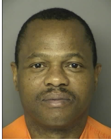
Wanted for: Criminal Sexual Conduct Name: Mack Arthur McCray