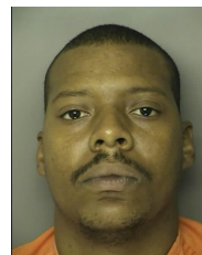
Wanted for: Forgery Name: Byron Devon Graham